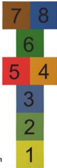
GIOCO CAMPANA 1